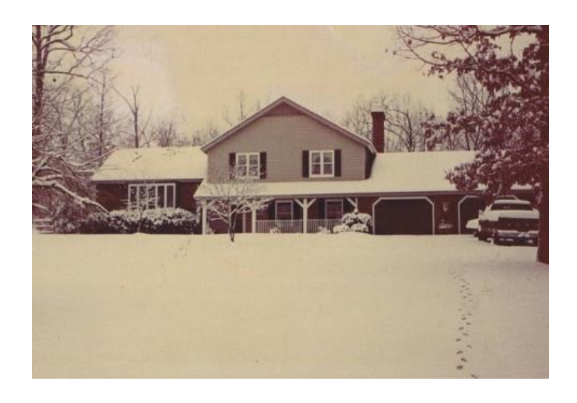
June 9, 2000 was the day it moved to a pretty brick duplex at 1103 Heath Ave. in Lynchburg, VA.